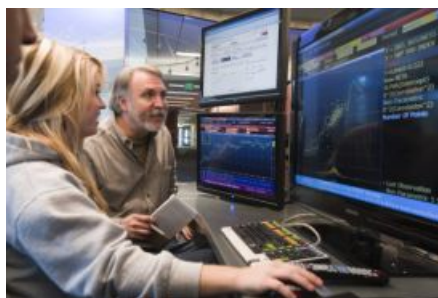
Research occurring at CSU was part of the Forbes ranking

According to Forbes magazine, Fort Collins is fifth in its list of "Best Places for Business and Careers" - ahead of those cities - partly because of its location near the university. Forbes on Thursday released its top 10 list, which largely focuses on Western cities (six of the 10). As part of the ranking, the magazine mentioned Colorado State University as a key piece that attracts businesses.