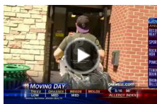
CSU students return to Fort Collins residence ... Aug 19, 2011