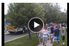
911 recordings during CSU mega-party Aug 31, 2011